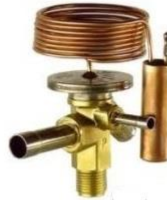
Pájecí provedení TILE